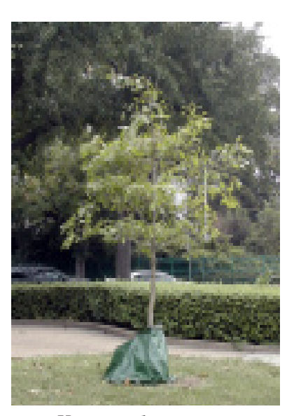
Young oak tree

All who have made donations, large or small, to this crucial renovation project should take pride in the accomplishment of our worthy goal.