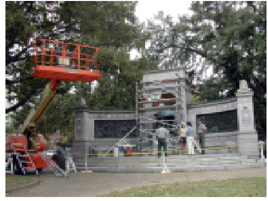
Renovation Crew at work

Of course, her work had actually begun months before when she did the research,