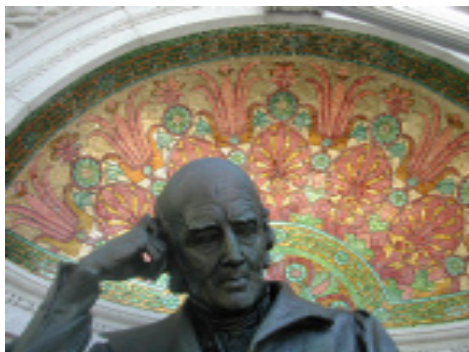
The restored head of Hahnemann's statue framed by the repaired mosaic

Although the repair on the mosaic had been completed in the spring, there was still a scaffold in front of the Hahnemann statue to facilitate the restoration work on the bronze statue itself.