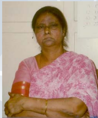
After chemotherapy Before homoeopathic treatment